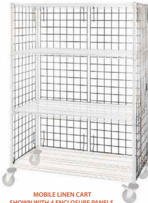
MOBILE LINEN CART SHOWN WITH 4 ENCLOSURE PANELS. MOBILE LINEN CARTS AVAILABLE See pgs. 142 & 144