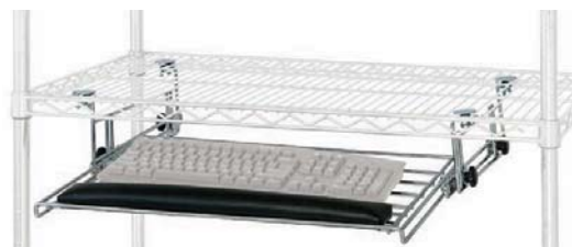
KEYBD Keyboard Shelf

Mounts under any size wire shelf and accepts keyboards up to 21"W x 11"D. Has a 6" height adjustment. Measures 25-1/4"W x 15"D x 4-1/4"H