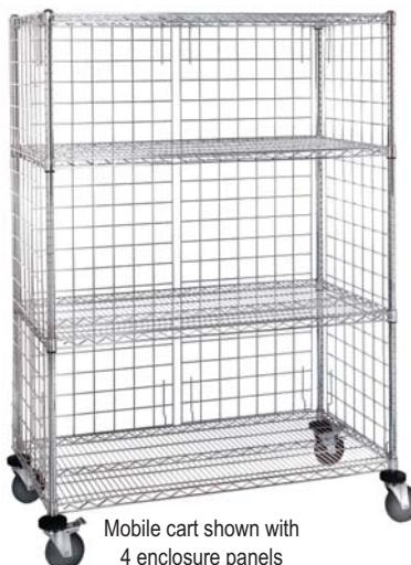
Mobile cart shown with 4 enclosure panels