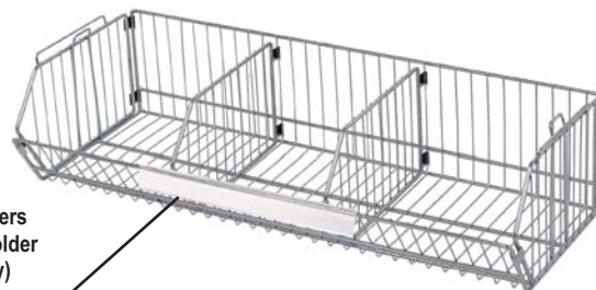
1436BC Shown with Dividers and Clear Label Holder (Sold separately)

Offer a variety of storage, display and mobile supply applications. Dividers can be used to separate product. Accessible front and a wide selection of sizes allow for all types of product to be used from storage to display. (Dividers sold separately) Finish: Chrome