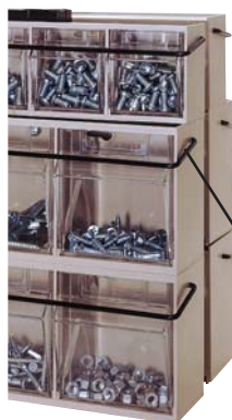
QLR500 Locking Rod Keeps bins from tilting open