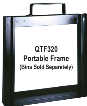
QTF320 Portable Frame (Bins Sold Separately)