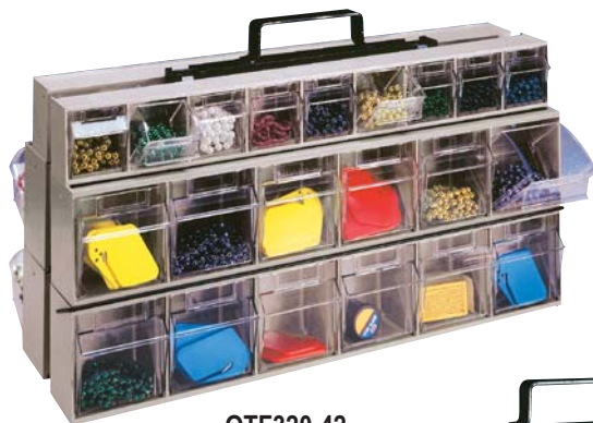
QTF320-42 Complete Unit