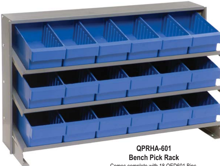
QPRHA-601 Bench Pick Rack

Comes complete with 18 QED601 Bins. Has 3 Shelves. 250 lb. capacity.