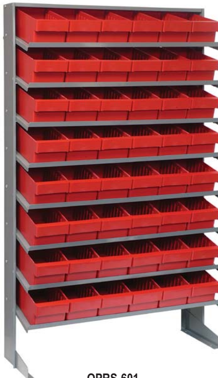
QPRS-601 Single Sided Pick Rack

Comes complete with 48 QED601 Bins. Has 8 Shelves. 400 lb. capacity.