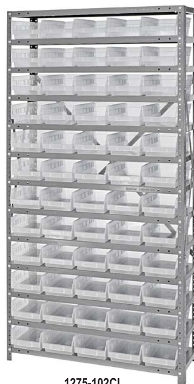
1275-102CL 12"D x 36"L x 75"H