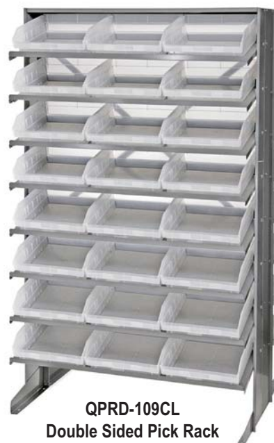
QPRD-109CL Double Sided Pick Rack