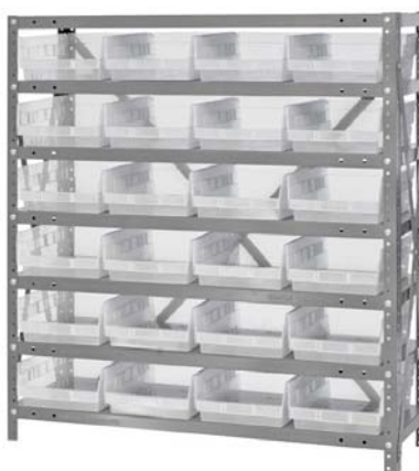
1239-107CL 12"D x 36"W x 39"H