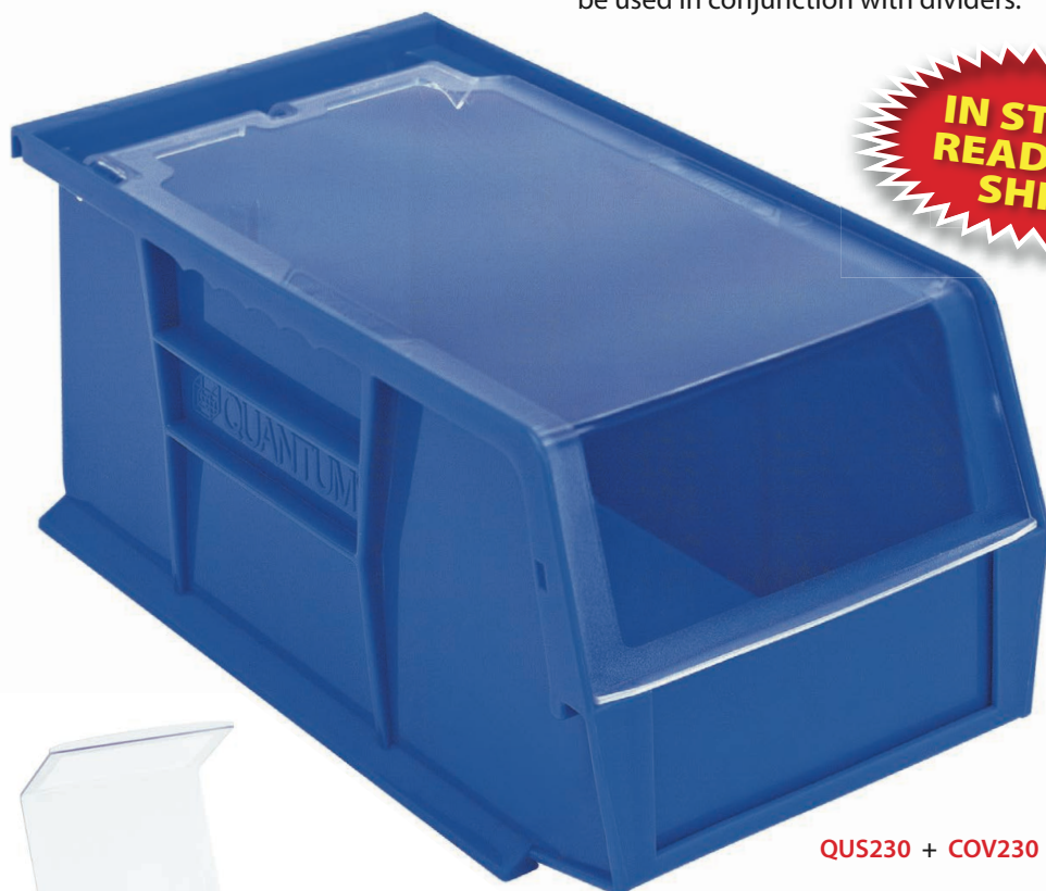
QUS230 + COV230