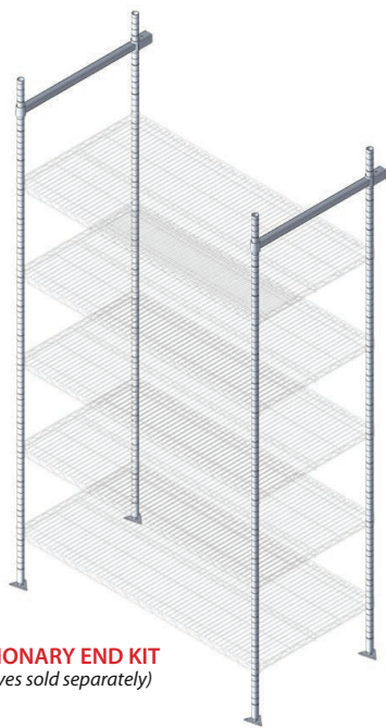
STATIONARY END KIT (Shelves sold separately)