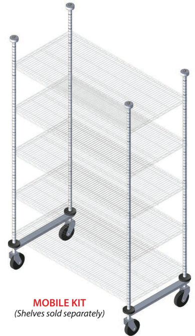
MOBILE KIT (Shelves sold separately)