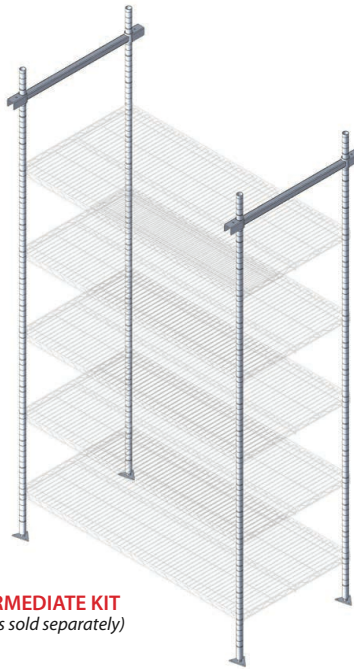
INTERMEDIATE KIT (Shelves sold separately)