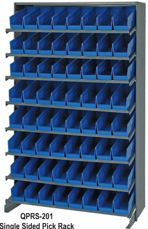
QPRS-201 Single Sided Pick Rack 400 lb. capacity.