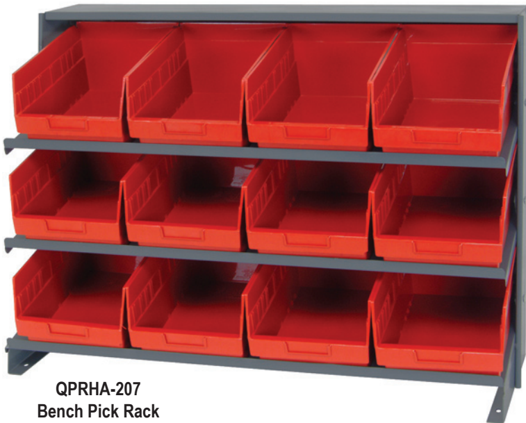
QPRHA-207 Bench Pick Rack 250 lb. capacity.

Eight QSB201, five QSB202, four QSB207, three QSB209, six QUS230, three QUS235, and two QUS245 fit across a standard 36" wide pick rack shelf.