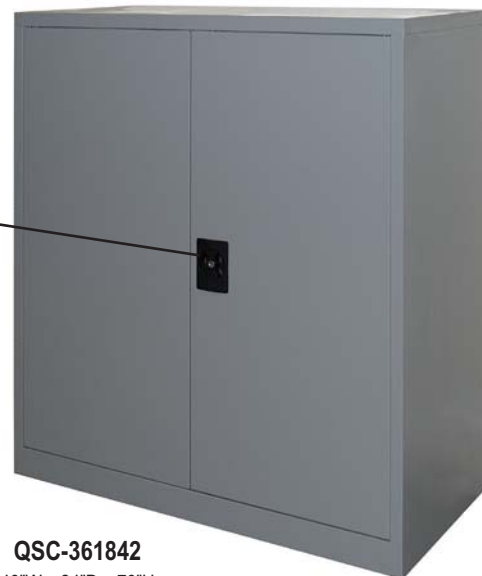
QSC-361842 48"W x 24"D x 78"H

Economy Industrial Cabinets include a 3-point Locking recessed handle with keys