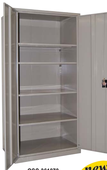
QSC-361878 48"W x 24"D x 78"H